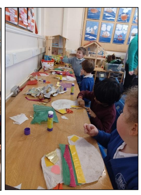
Year Two, 'Fairy Tales' Topic

The children made pumpkin carriages, fairy tale castles and magic potions to start their Fairy Tales topic.